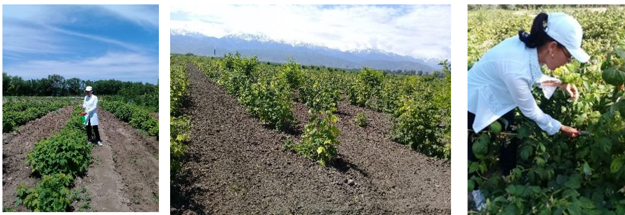
Figure 1 - Determining the seasonal movement of growth and development of the studied varieties

Simultaneously with the growth of the shoot in each node, leaves are formed on it. Their growth lasts 30-32 days. The development of leaves on the shoot is also uneven: in the middle part of the shoot, the leaves are larger than in the lower and upper parts. Also, the area of the leaf surface directly depends on the number of replacement shoots and their height.